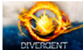
BOOK REVIEW OF 'DIVERGENT' BY KATRINA PAYOD